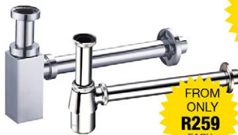
BASIN TRAPS AVAILABLE IN BLACK AND CHROME SQUARE AND ROUND